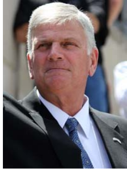
Rev. Franklin Graham

As I read Franklin's comments, I was reminded of a scripture that has meant a lot to me during these troubled times: "If My people who are called by My name, shall humble themselves, and pray and seek My face, and turn from their wicked ways, then will I hear from heaven, and forgive their sin, and heal their land" (2 Chronicles 7:14 NKJV).